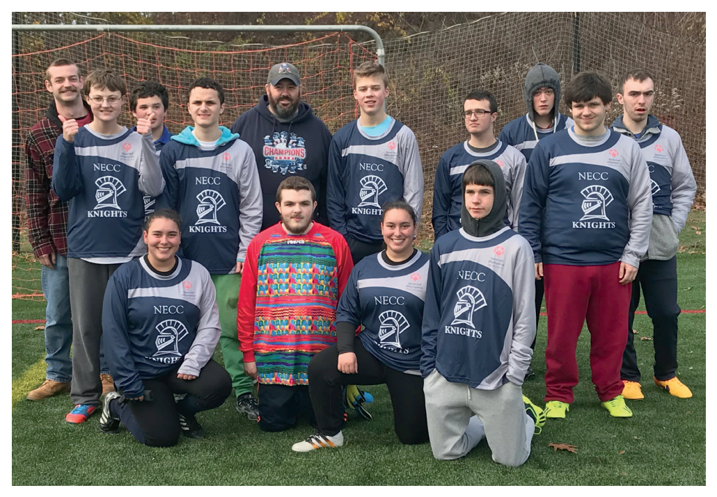
NECC Knights Special Olympics soccer team

Your gift gives teachers opportunities to learn from the best, grow their careers, and help the children with autism we serve achieve their goals large and small. Thank you.