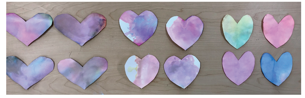
Valentine hearts created by NECC students